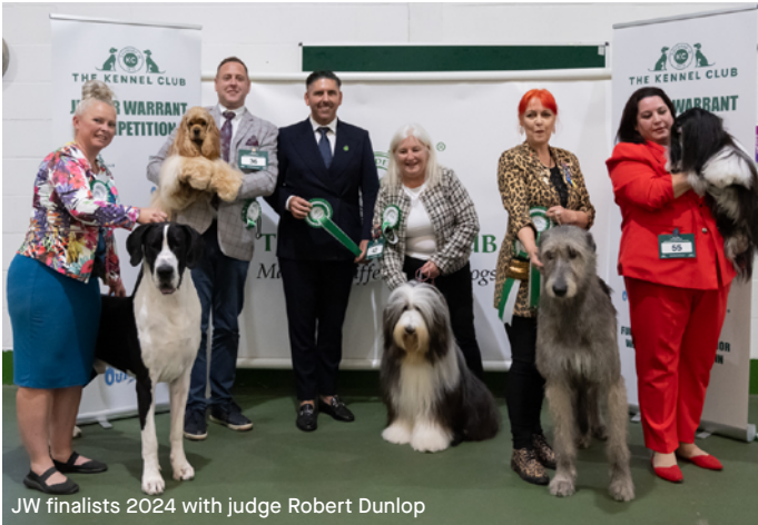
JW finalists 2024 with judge Robert Dunlop