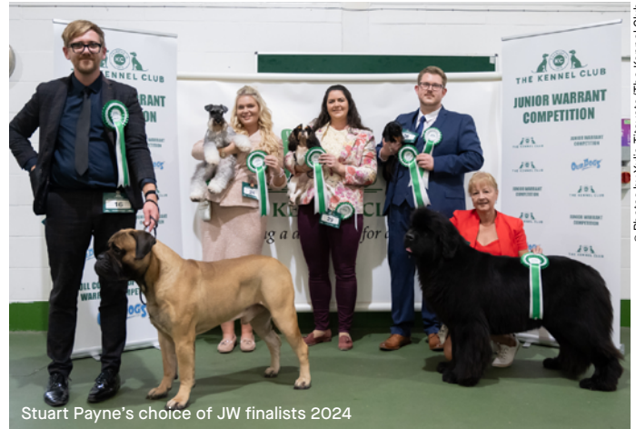
Stuart Payne's choice of JW finalists 2024